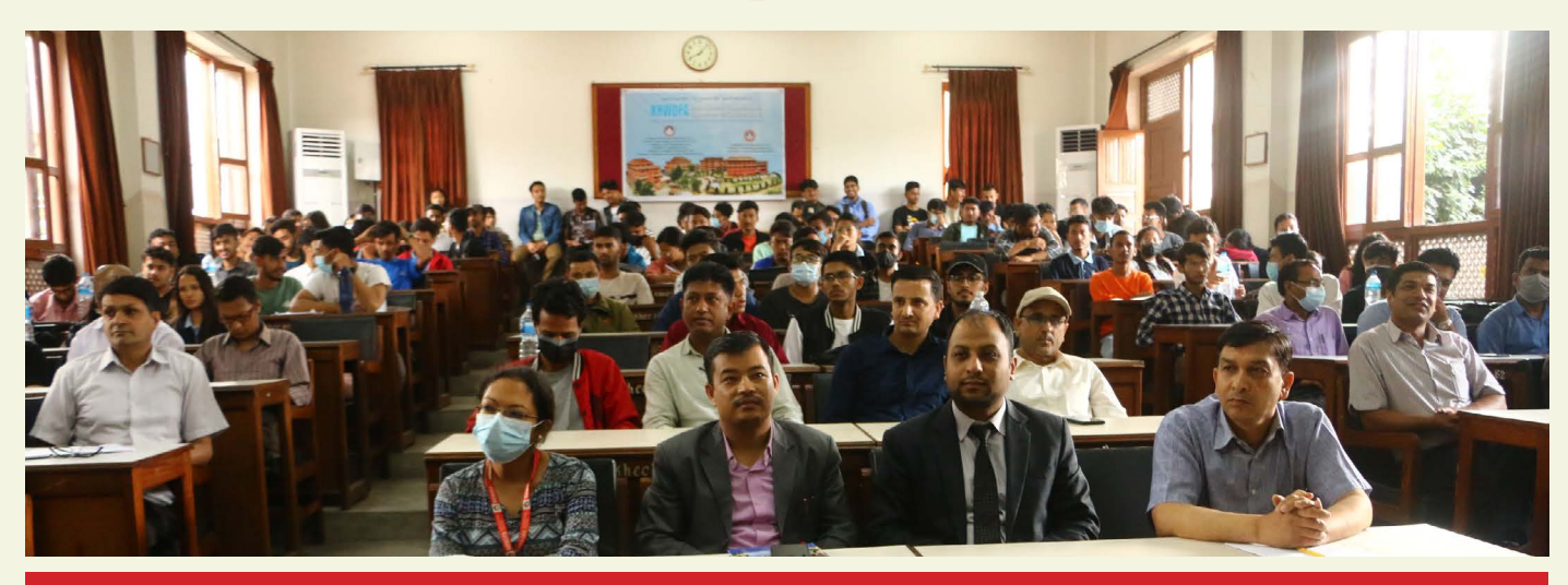
Khwopa faculty members and students at Debate Competition.